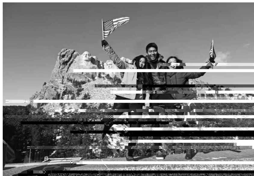
More than 1000 UQ students participated in UQ's